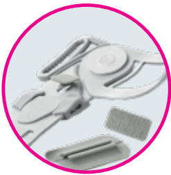
③ With the help of the padding clip, the pads can be easily secured to the frame via hook-and-loop fasteners