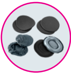
① Comprehensive padding set for individual patient adaption

At www.medi.biz/oa you will find suitable physiotherapy exercises that your patient can do comfortably at home. Experts explain the most important points of the exercises.