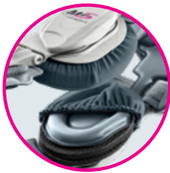
④ A high level of comfort: Double-layered condylar pad-covers reduce friction on the skin as the two layers of fabric slide easily against each other